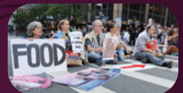
New York City rabbis and cantors are arrested after blocking traffic in front of the Israeli consulate protesting the war in Gaza and the Israeli government's policy of starvation.