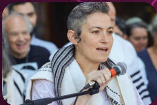
T'ruah rabbis gather in Los Angeles to call for a surge of humanitarian aid to Gaza.