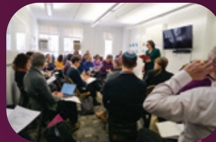
Nearly 100 rabbis and cantors gather in New York City to strategize resistance as the new Trump administration begins.