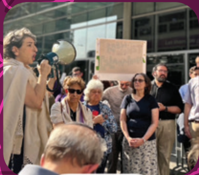
Chicago area T'ruah rabbis and cantors take to the streets to protest starvation in Gaza.