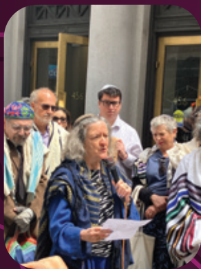
Rabbi Amy Eilberg leads a protest in the Bay Area outside the Israeli Consulate against the war in Gaza.